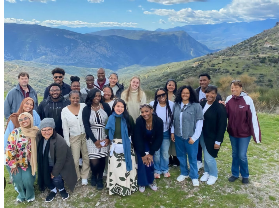
CHEATHAM-WHITE STUDY ABROAD 2024: DELPHI, GREECE