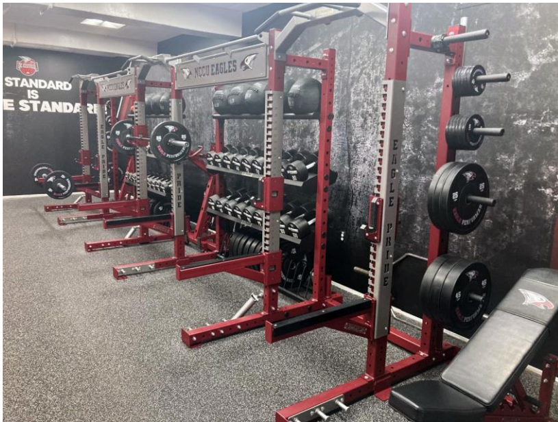
McDougald-McLendon Arena Weight Room