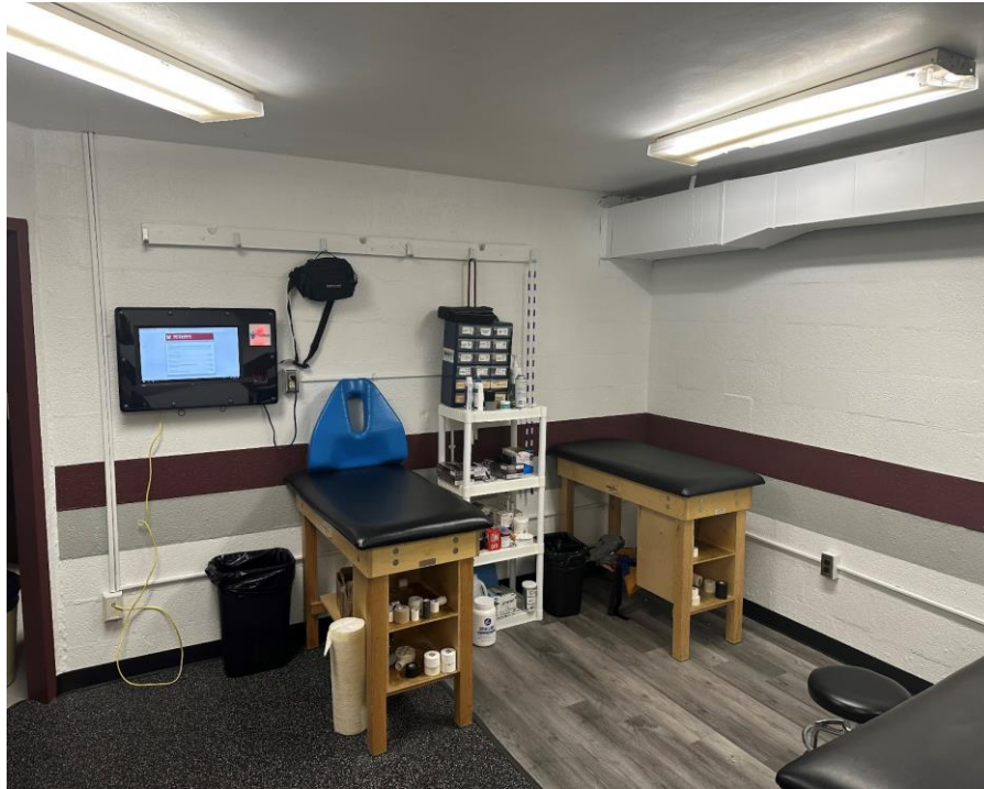
Athletic Training Room