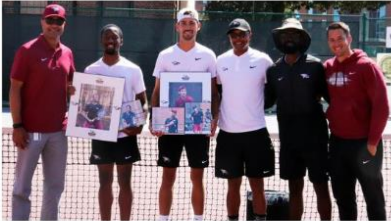
NCCU Men's Tennis Outlast Longwood on Senior Day