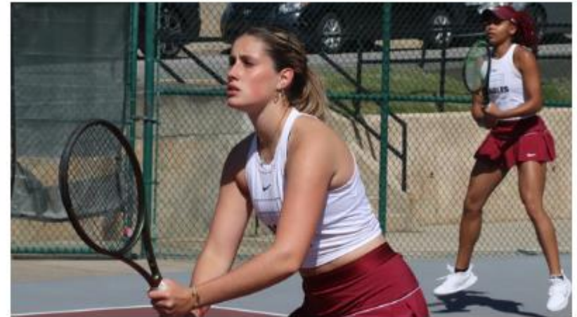
NCCU Women's Tennis Defeats Longwood 4-1